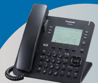
KX-NT630 Monochrome LCD

*In the case of displaying the image of a QR code, it may not be legible with the reading device depending on the size of the QR code.