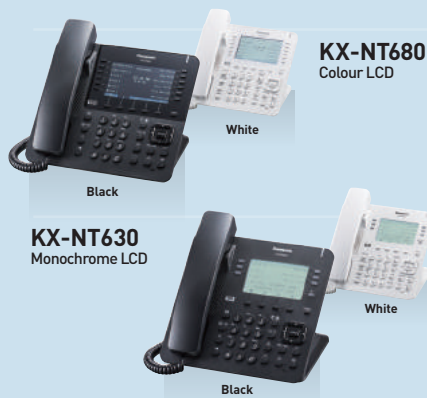
KX-NT680 Colour LCD