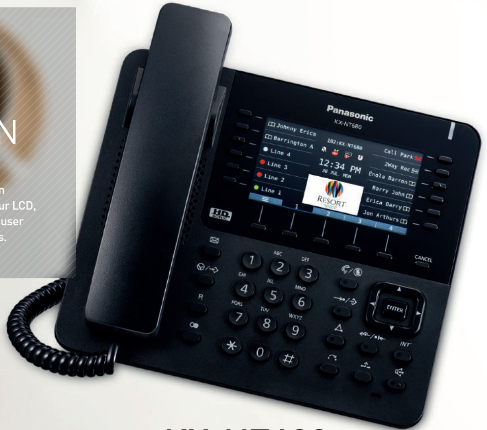
HD SONIC KX-NT680 Colour LCD

With the ever-changing business world in mind, at Panasonic we created a new type of communication equipment, ready for the future. Using a clear colour LCD, integrating High Definition Audio and an enhanced user interface, we provide for the needs of current users.