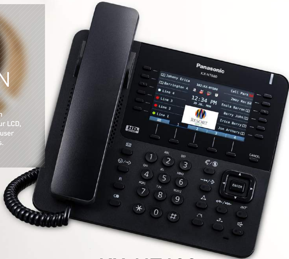
HD SONIC KX-NT680 Colour LCD

With the ever-changing business world in mind, at Panasonic we created a new type of communication equipment, ready for the future. Using a clear colour LCD, integrating High Definition Audio and an enhanced user interface, we provide for the needs of current users.