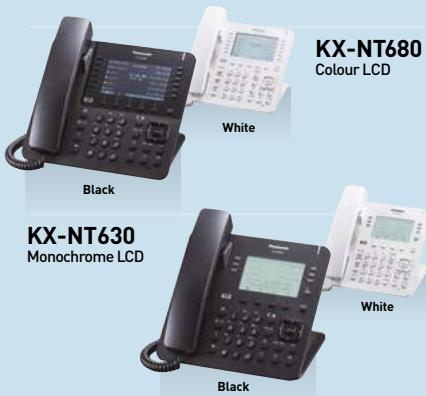
KX-NT680 Colour LCD