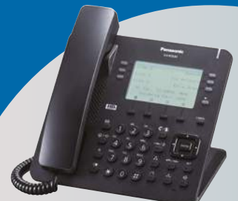
KX-NT630 Monochrome LCD

*In the case of displaying the image of a QR code, it may not be legible with the reading device depending on the size of the QR code.